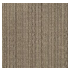
Creme De La Cre 60103