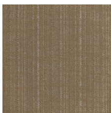
Suede Sensation 60201