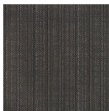
Chocolate Silk 60500