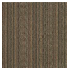
Javanese Spice 60713