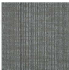
Seaside Eleganc 60530