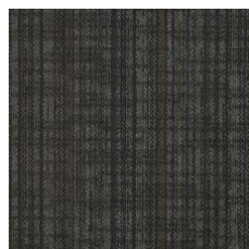
Black Cashmere 60505