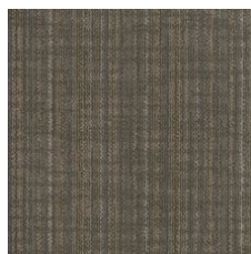
Natural Tonic 60755