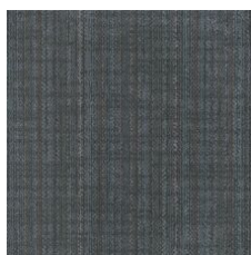
Tahitian Pearls 60400