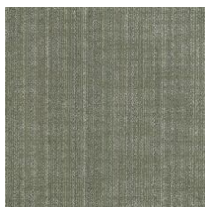
Kiwi Kani 60544